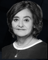
Cherie Blair CBE QC